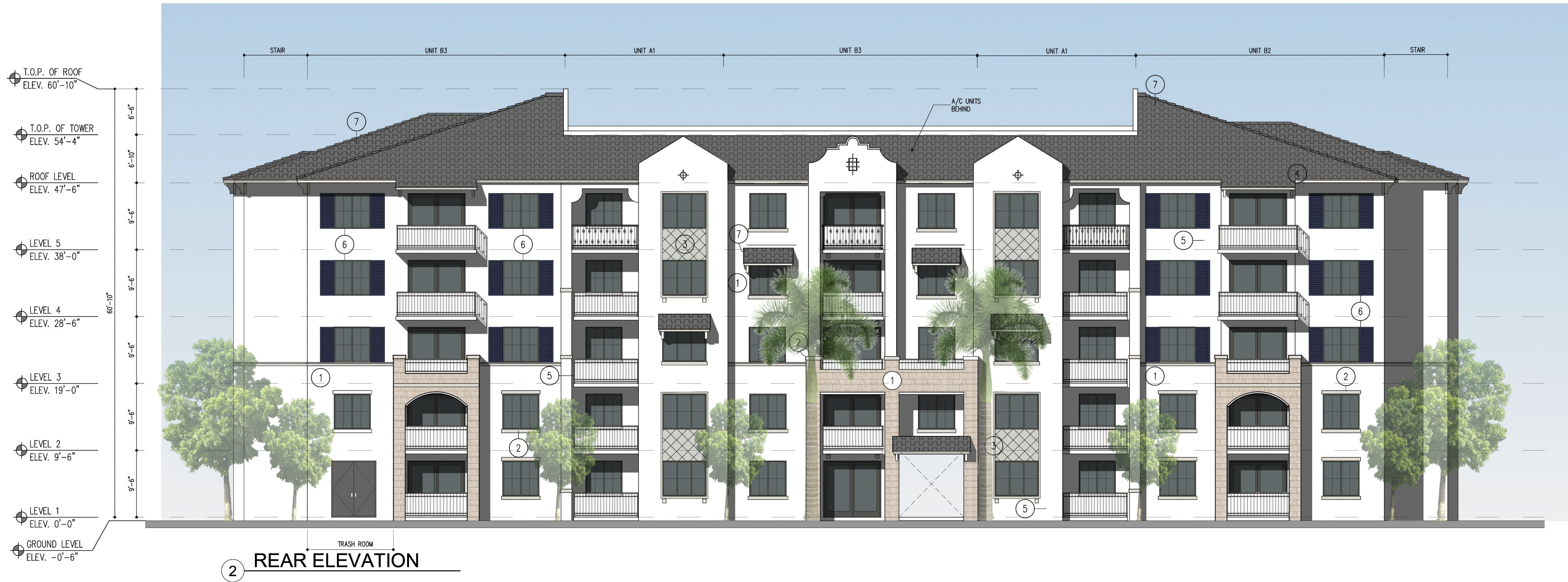
2 REAR ELEVATION